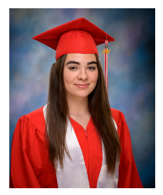
India Deal President